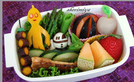
Use Star Wars characters as a alternative to feed vegetables to your human children.

Some ideas to forming these scenes to feed your children can include, R2D2 and C3PO hanging out in a field in the planet of Naboo.