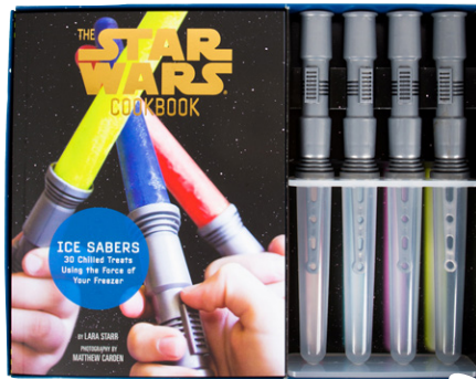
This cookbook is great for families and friends who live in hot planets like Tatooine and Earth.

This book has 30 sweet, chilled treats in this Star Wars-themed cooking kit, from Mos Icelly to Qui-Gon Gin-